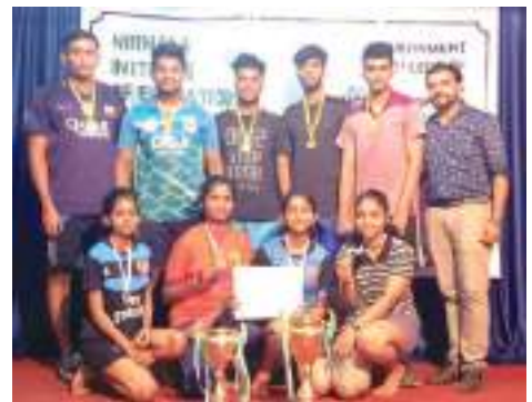
The Invitational Inter-Collegiate Table Tennis Tournament organized by Department of Physical Education, Nirmala Institute of Education and Govt. College, Sanquelim. College Boys Team Emerge as the winners in Mens category and College Women's Team Emerged first runners up in the Women's category.