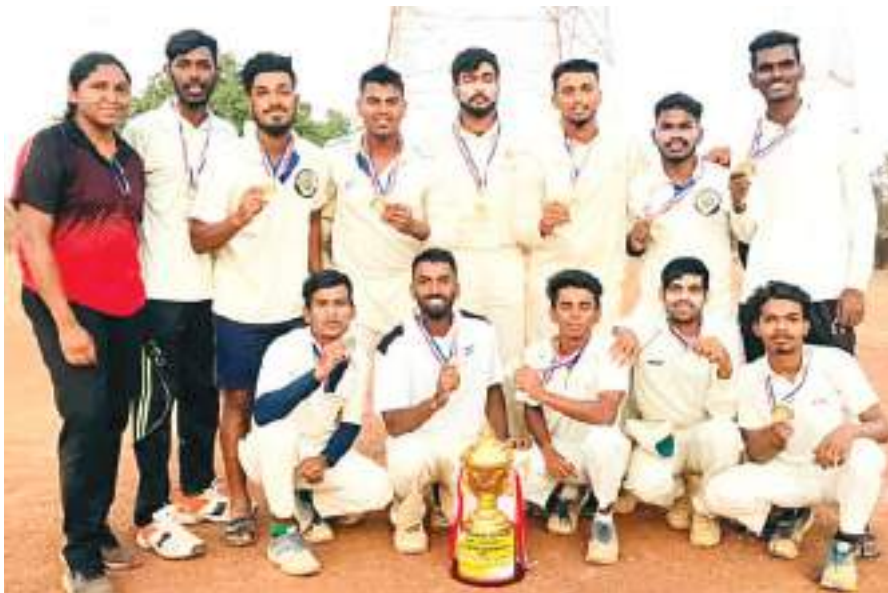
Cricket Men's Team won Runner's Up at Inter-Collegiate Cricket Tournament organised by V. M. Salgaocar College of Law, Miramar, Goa University.