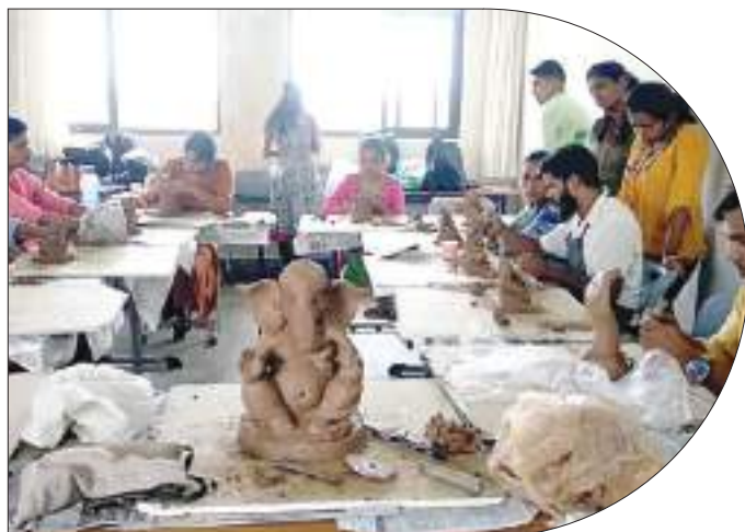
Certificate course on Skill based Entrepreneurship in Clay Ganesh Idol-Making