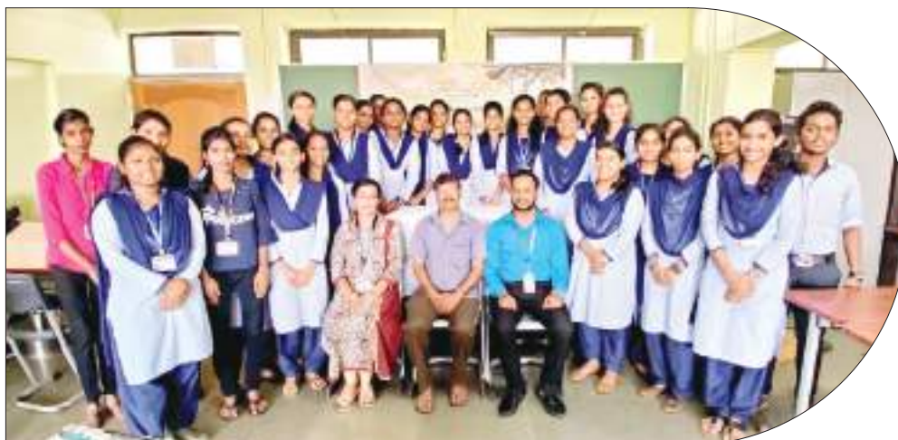
The Nisarg club organised a workshop on Techniques in Production of Organic Colours for Holi.