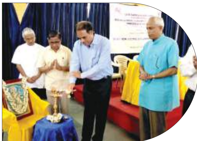
National Education Policy 2019 Seminar jointly organised by Vidya Prabodhini College and Vidya Bharati