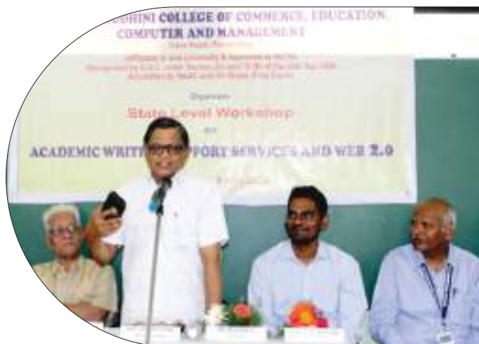
State Level Workshop on "Academic Writing Support Services and Web 2.0" organised by Dept. of Lib. Science