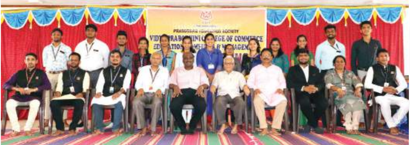
Students Council for the Academic Year 2019-20