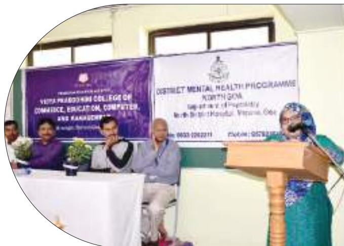
Life Skills approach in Psychological Health Promotion of Students Workshop