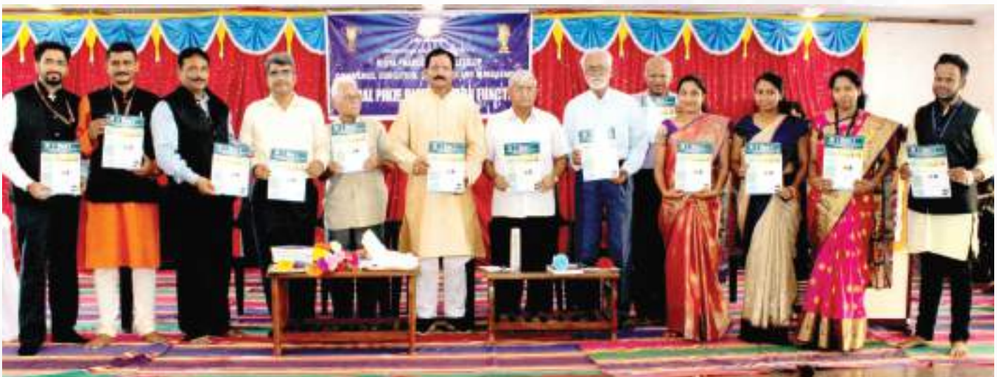
Release of First Edition of College Newsletter at the hands of Shri. Shripad Y. Naik, Hon'ble Union Minister of State (Independent Charge) in the Ministry of AYUSH and Minister of State for Defence.