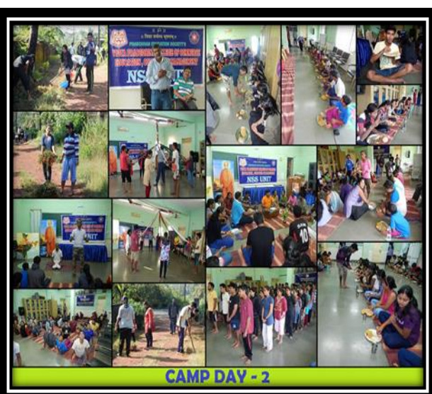
CAMP DAY - 2