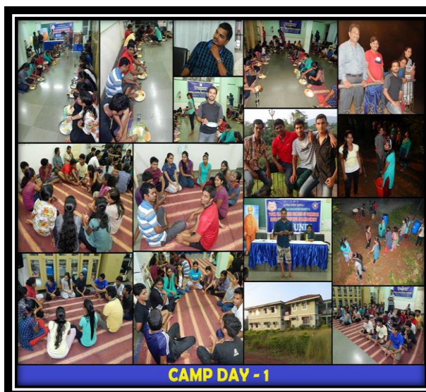
CAMP DAY - 1