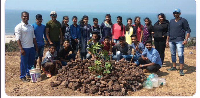
The NSS Unit of the College along with the Mandre Villagers organized a tree plantation drive & planted 70 saplings at Junaswada, Mandre on 5th June 2018 to celebrate World Environment Day