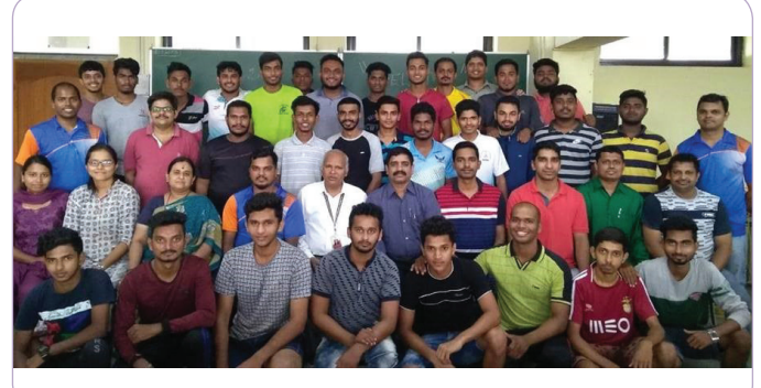
The NSS unit of Vidya Prabodhini College organized a Two Day NSS Special Camp on 18th and 19th August 2018 in the college campus.