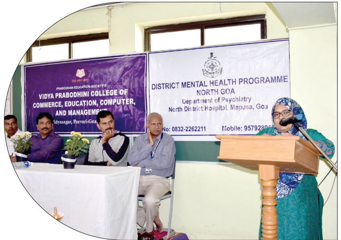
Life Skills approach in Psychological Health Promotion of Students Workshop