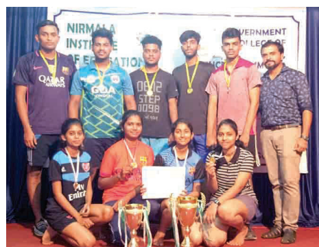
The Invitational Inter-Collegiate Table Tennis Tournament organized by Department of Physical Education, Nirmala Institute of Education and Govt. College, Sanquelim. College Boys Team Emerge as the winners in Mens category and College Women's Team Emerged first runners up in the Women's category.