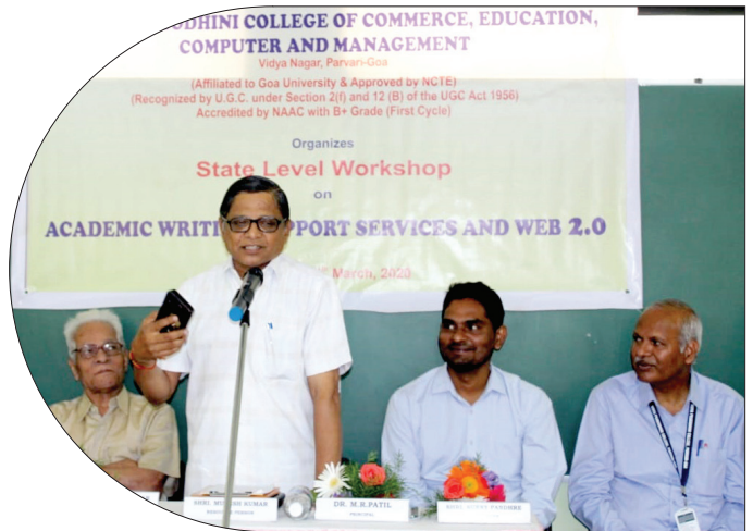
State Level Workshop on "Academic Writing Support Services and Web 2.0" organised by Dept. of Lib. Science