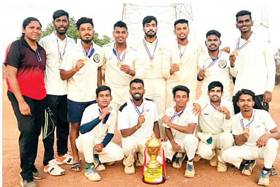
Cricket Men's Team won Runner's Up at Inter-Collegiate Cricket Tournament organised by V. M. Salgaocar College of Law, Miramar, Goa University.