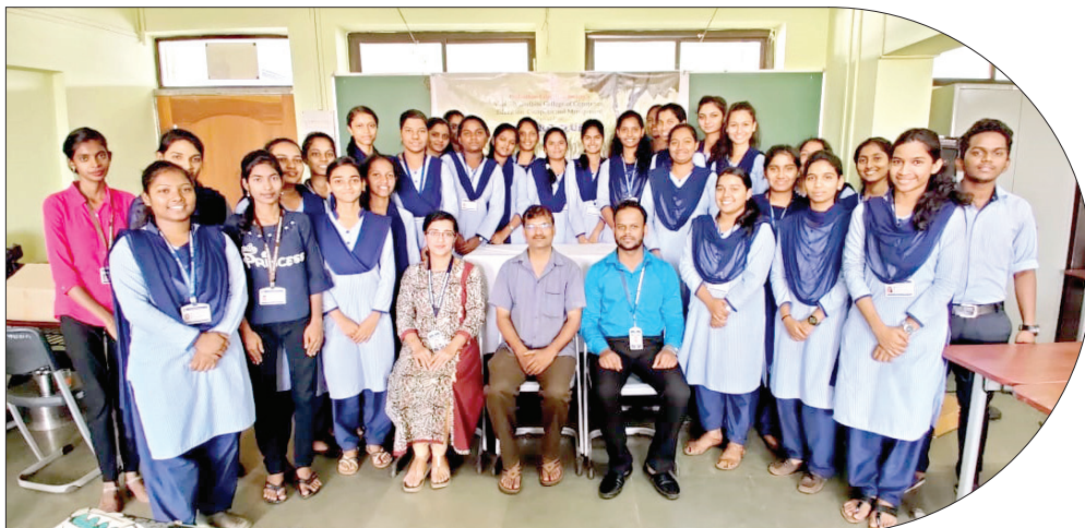
The Nisarg club organised a workshop on Techniques in Production of Organic Colours for Holi.