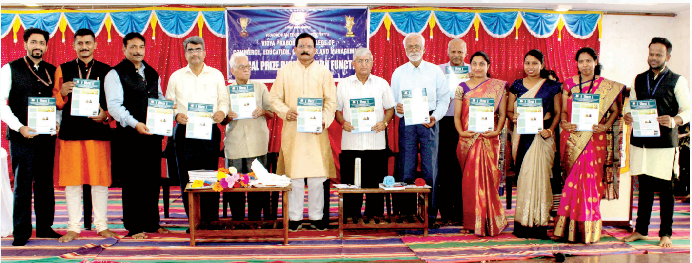
Release of First Edition of College Newsletter at the hands of Shri. Shripad Y. Naik, Hon'ble Union Minister of State (Independent Charge) in the Ministry of AYUSH and Minister of State for Defence.