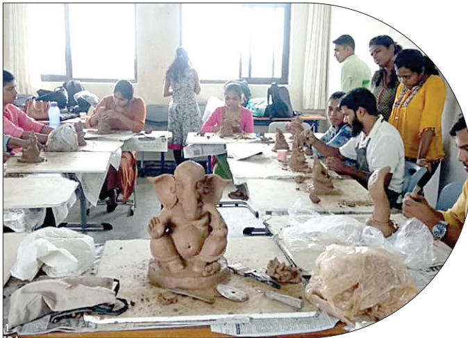
Certificate course on Skill based Entrepreneurship in Clay Ganesh Idol-Making