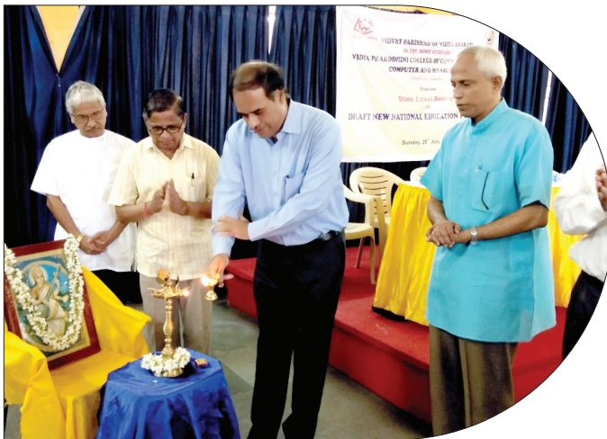
National Education Policy 2019 Seminar jointly organised by Vidya Prabodhini College and Vidya Bharati