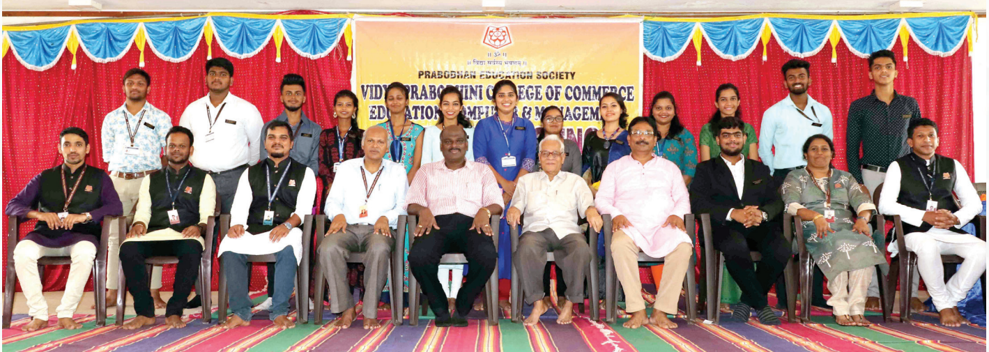
Students Council for the Academic Year 2019-20