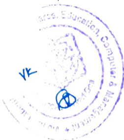
Miss Vaibhavi P. Chodankar Activity In-charge

Later these all videos were clubbed together and uploaded on Instagram (Social Media) and told other students to view it