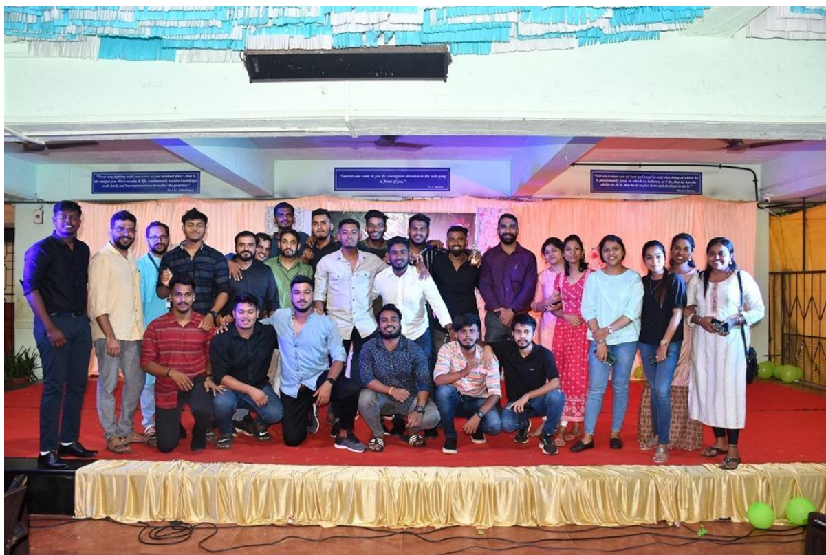
Srujansangam 2022 (06/11/2022)