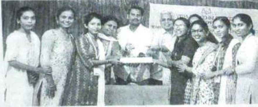
'फेस्ट ओ बिझ' उपक्रमातील विजेत्यांसमवेत मान्यवर.